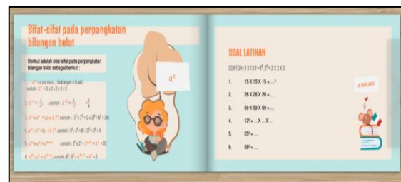
Figure 3. The platonic aspect of learning mathematics

colors, music, buttons, etc. was well fulfilled. In terms of material presentation related to the "learning math" aspect, the material was straightly presented. KI and KD were provided and the material was presented briefly accompanied by sample problems, and the presentation of exercise questions guided students to do independent questions. The presentation of the material referred to the platonic belief that learning mathematics was a process of constructing knowledge (see Figure 3).