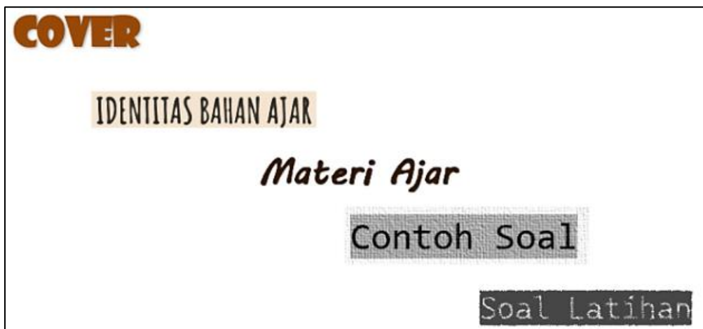
Figure 2. Teaching Material Format.

summaries, practice questions, and evaluation questions. Next, collect weaving drawings and draw flat wake models using the geogebra application. The developed teaching materials focused on rhombic balanced builds (Figure 3). The introduction of teaching materials contains cover and identity, the content of teaching materials, and the evaluation section consists of practice questions.